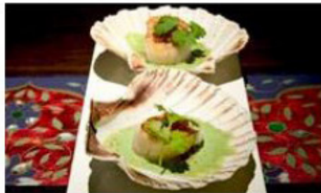
Amaya's scallops.

The notion of the big-ticket Indian restaurant has never quite worked in Britain. Partly it's our own expectations. There are literally thousands of cheap curry houses in the UK. As a result we find it hard to get our heads around paying serious wedge for curries, whose names we recognise from those budget joints. And then there's the restaurants